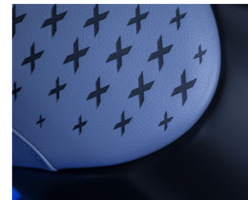
Steel Blue seat